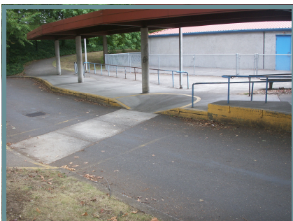
Non-compliant Curb Cut Ramp

This curb ramp at Holladay Center is a good example which illustrates a curb cut that slopes too steeply both in the direction of travel and in the side flares, and is also missing detectable warnings.